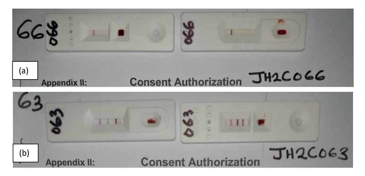
Figure 2: Pictures of test cassettes with results, on participants' consent forms. (a) Both cassettes show negative results for participant 66. (b) Both cassettes show IgM and IgG positive for participant 63. In (b), the FDA-EUA-Kit is pictured on the right.

Care was taken to place samples from each participant in both sets of test cassettes at the same time, with the results read from both after 10 or 15 minutes accordingly. Pictures of both cassettes placed on the consent forms of the participant were taken by the research assistants, as further evidence of test carried out, to eliminate any doubts over tabulated summary sheets as shown in Figure 2 for two participants.